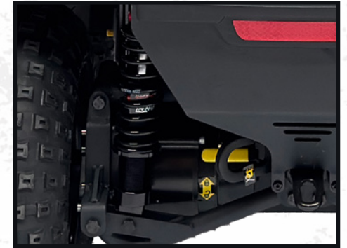
Smooth Ride Suspension (SRS)

With its coil-over design, where the spring is mounted around the shock absorber, SRS provides superior ride control, balancing