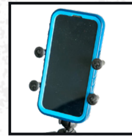
Mobile Phone / Media Holder