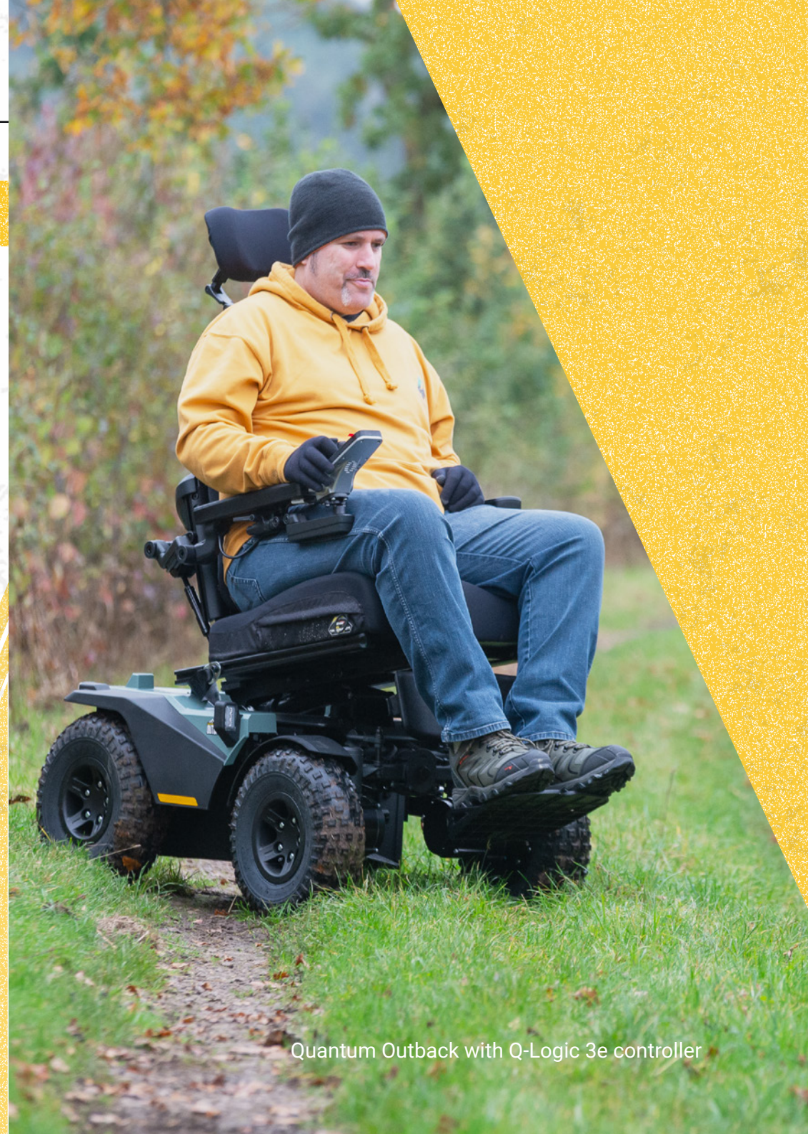
Quantum Outback with Q-Logic 3e controller