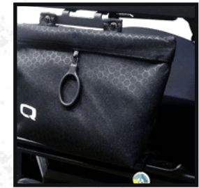
Personal Item Pouch