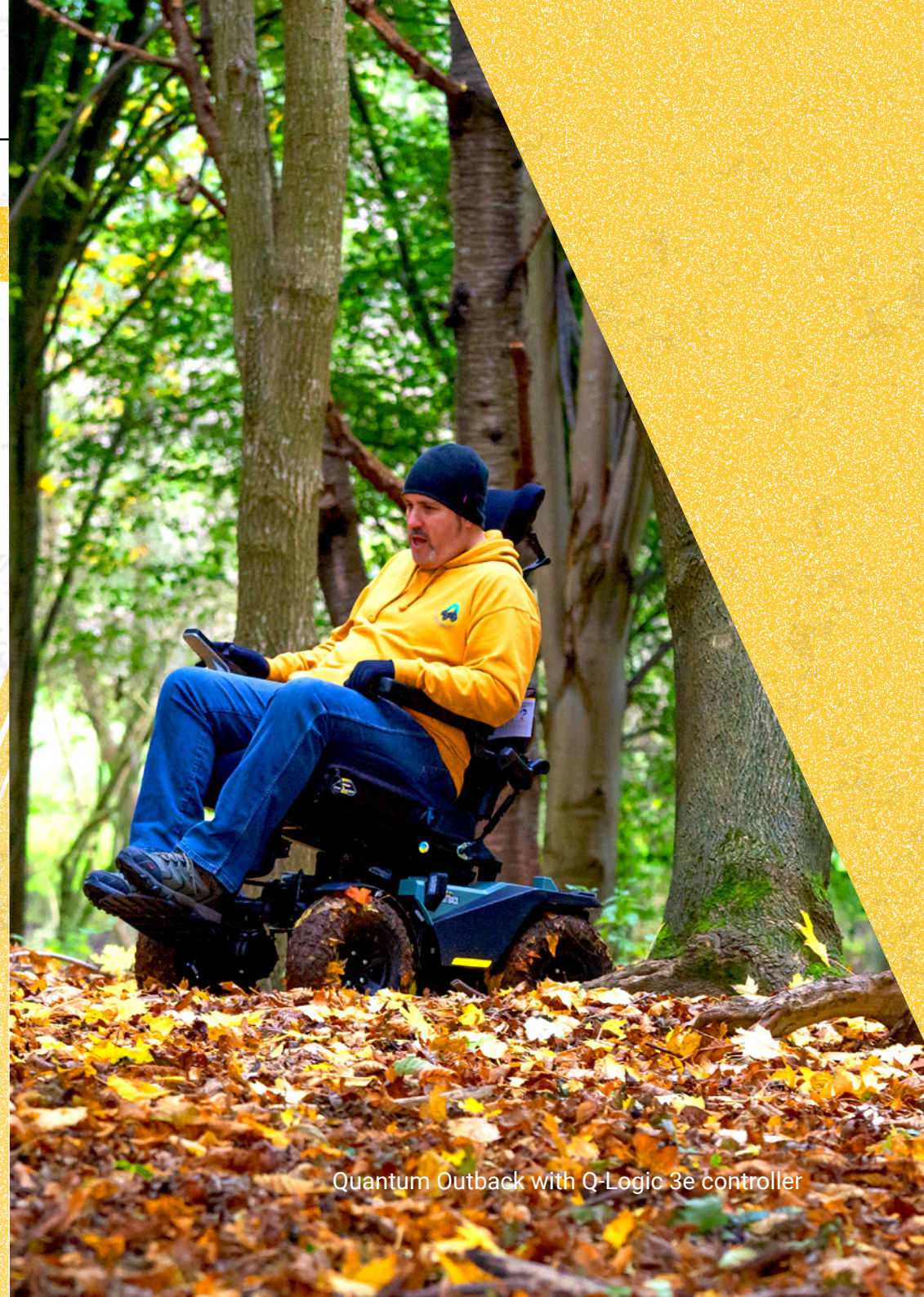
Quantum Outback with Q-Logic 3e controller