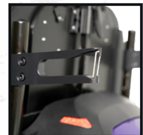
TRU Balance 3 Backpack Holder (Pair)