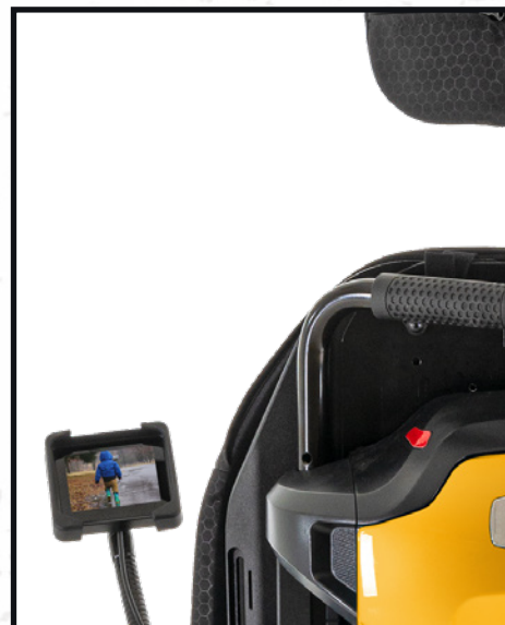
The Quantum® backup camera