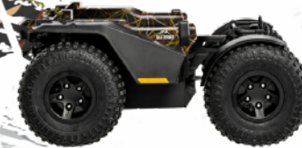
Tropic Lightning (Camo)