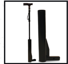
Universal Mount for Accessories