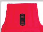
LT-EK 2" Seat Depth Extension Kit* **