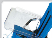
LT-WT Work-N-Play Tray*