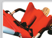
Contoured Seat Cushion