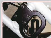
LT-TD Transportation Tie-Down Kit