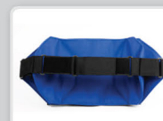
LT-DF Adjustable double flap lateral support with scoli pad