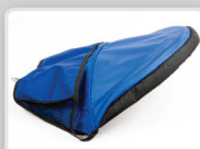
LT-BC Canopy / Includes Headrest Extension*