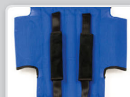
LT-BHC Soft Covers for H Harness