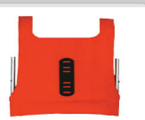
LT-RK 2" Seat Depth Reduction Kit*