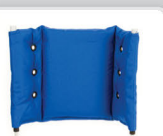
LT-HRE Headrest Extension*