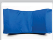
LT-HR Headrest Pad*