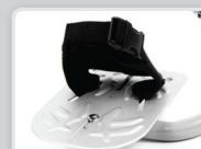
LT-BAC Heel Loop/ Ankle Cuffs