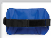
LT-BSF Adjustable Single Flap Lateral Support with Scoli Strap*